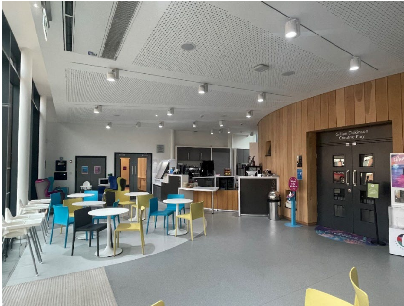
View to the left as you enter the building.