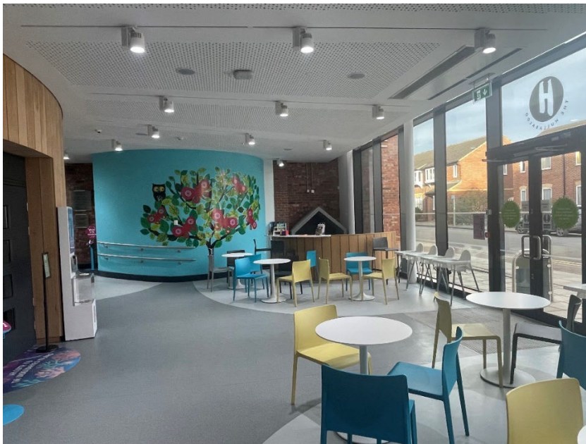
View to the right as you enter the building.

This area sometimes includes a long craft table and a story book corner.